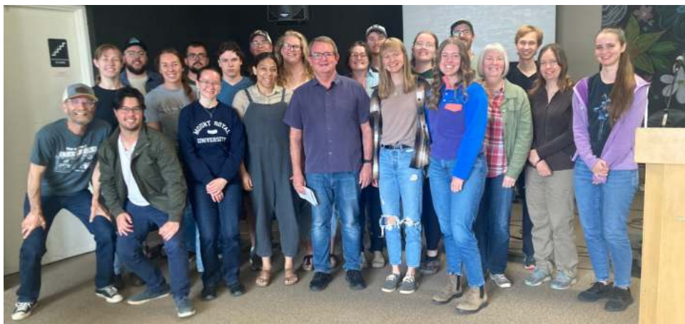
The 72 participants

For more info on upcoming events around CLBI, check out clbi.edu/events or call the CLBI Office at 780-672-4454 .